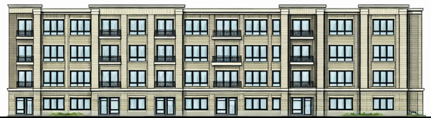
1 WEST ELEVATION AA1 1/16" = 1'-0"