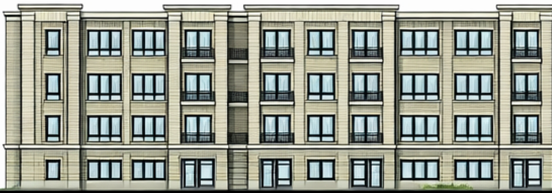
2 NORTH ELEVATION AA1 1/16" = 1'-0"