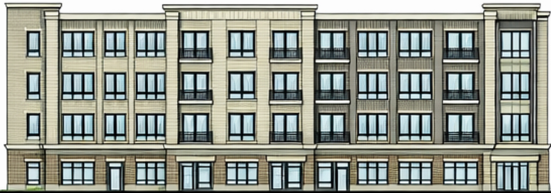
2 SOUTH ELEVATION AA1 1/16" = 1'-0"